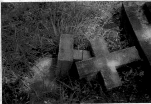
Muslims have desecrated Christian graveyards in Southern Sudan.

peace with a non-Muslim country until its inhabitants surrender to Islam. They can agree to a cease fire for a period of time – but never to peace with non-Muslims.