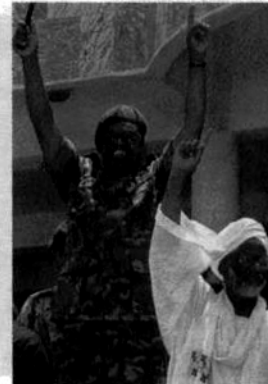
Lt. Gen. Al Bashir and Dr. Al Turabi

At a two week conference of Muslim leaders from 80 countries, hosted by Muammar Gaddafi in Tripoli, Libya (October 1995), strategies to transform Africa into an Islamic continent were discussed. Participants openly admitted that their goals were to make Arabic the primary language of the continent and Islam the official religion. One SA member of parliament, Farouk Cassim declared: "It will probably be the biggest revolution to sweep Africa." Head of the Islamic Propagation