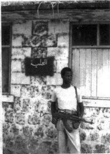
Christians in Southern Sudan have resisted the Islamic Jihad.