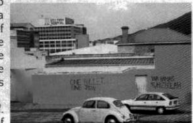
Graffiti in Cape Town Malay Quarter - a Jihad of words.

To achieve this is the goal of Jihad . Islamic scholars identify a multitude of forms that Jihad can take.